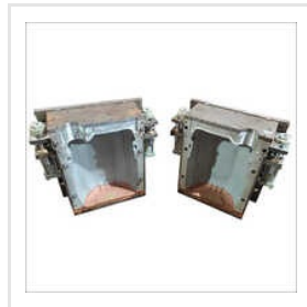
50 Ltr Capacity Mild Steel Moulds