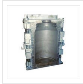
Plastic Drum Blow Mould