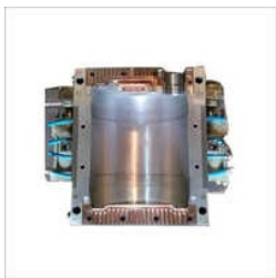
CONTAINER ALUMINIUM BLOW MOULD

210 Ltr Full Open Top Mould, 220 Litre Ring Barrel Mould, 50 Ltr Capacity Mild Steel Moulds, 50 Ltr Mild Steel Mould, Container Aluminium Blow Mould, Drum Blow Mould, Industrial Blow Mould, Industrial Plastic Blow Mould, Jerrycan Blow Mould, Mild Steel Container Blow Mould, Plastic Can Blow Mould, Plastic Container Blow Mould, Plastic Drum Blow Mould, Water Tank Blow Mould, etc.