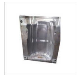
PLASTIC CONTAINER BLOW MOULD