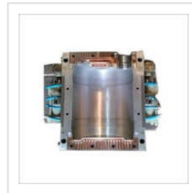
Mild Steel Container Blow Mould