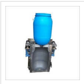
Drum Blow Mould