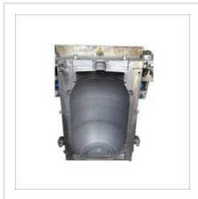
Industrial Blow Mould