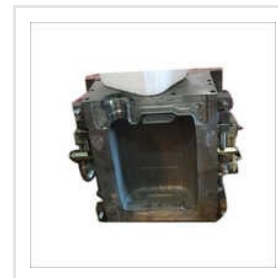
Plastic Can Blow Mould