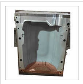
50 Ltr Mild Steel Mould