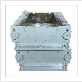
220 Litre Ring Barrel Mould