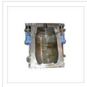
Industrial Plastic Blow Mould