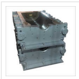
210 Ltr Full Open Top Mould