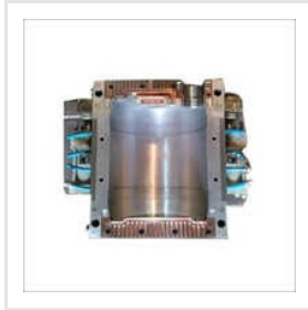
Container Aluminium Blow Mould