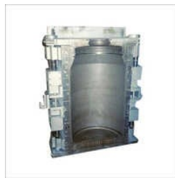
PLASTIC DRUM BLOW MOULD