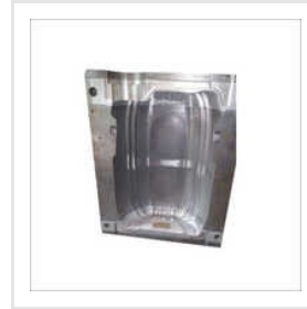
Plastic Container Blow Mould