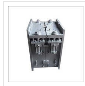
Water Tank Blow Mould