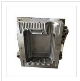
Jerrycan Blow Mould